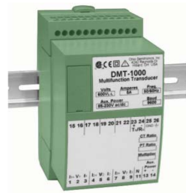
The universal basic version DMT-1000 in housing T24, clipped onto a top-hat rail.

Ancillary functions include a power system check, provision for displaying the measured variable on a PC, the simulation of the outputs for test purposes, and a facility for printing nameplates. The transducer fulfills all the essential requirements and regulations concerning electromagnetic compatibility (EMC) and safety (IEC 1010 and EN 61 010). It was developed and is manufactured and tested in strict accordance with the quality assurance standard ISO 9001 and carries CE and CSA certifications.